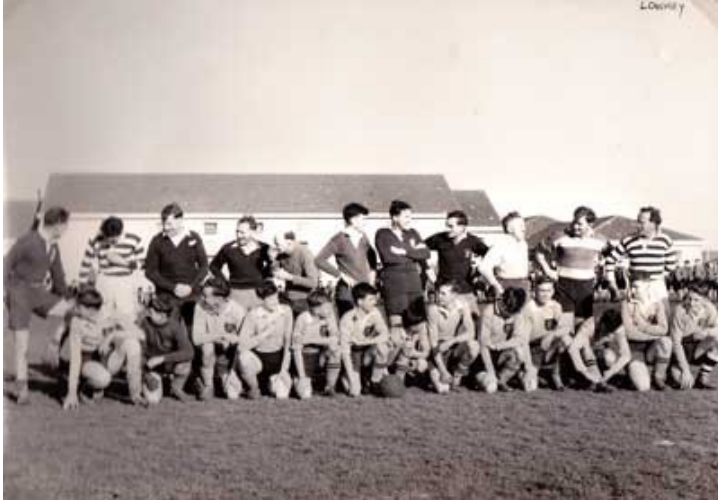
Staff and First Eleven pose before the match