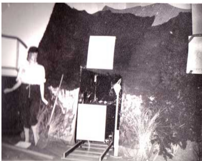
The theme of the School Dance was "Modern Hit Tunes". This corner picturing a mine, represents the hit "16 Tons".