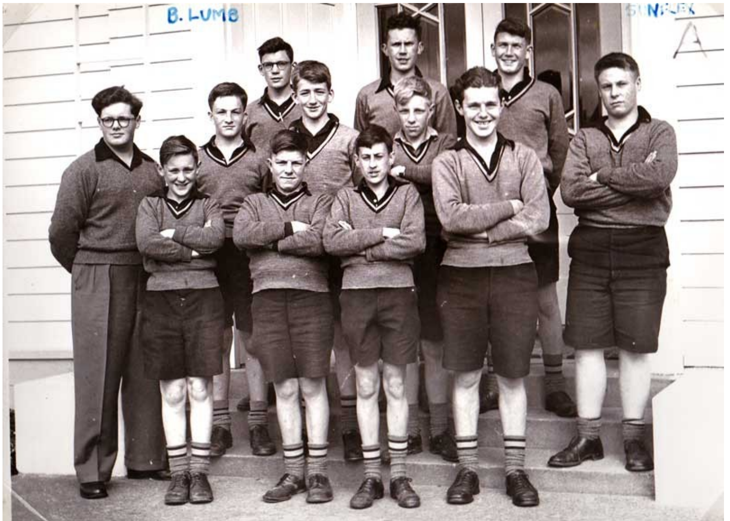
The School Drama Club