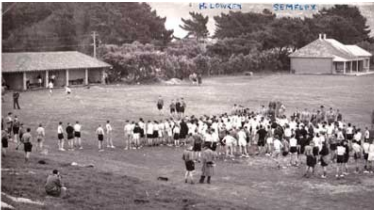
Ready for the start of the 1956 Cross Country races at St. Kilda

P. Dey came strongly through the big field from the scratch mark to finish in ninth place and record fastest time. I. F. Farrant, who started 10 seconds before Dey, finished only eight seconds behind him, and gained second fastest time.