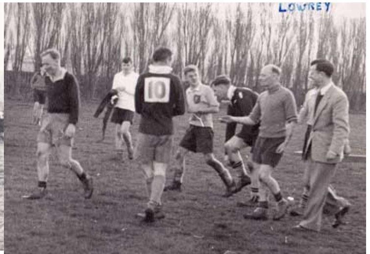
Teams leaving the field