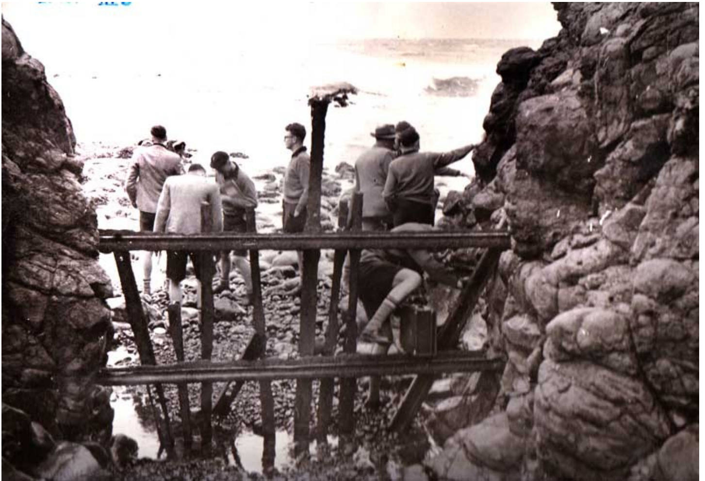
Biological Survey—Second Beach, St. Clair