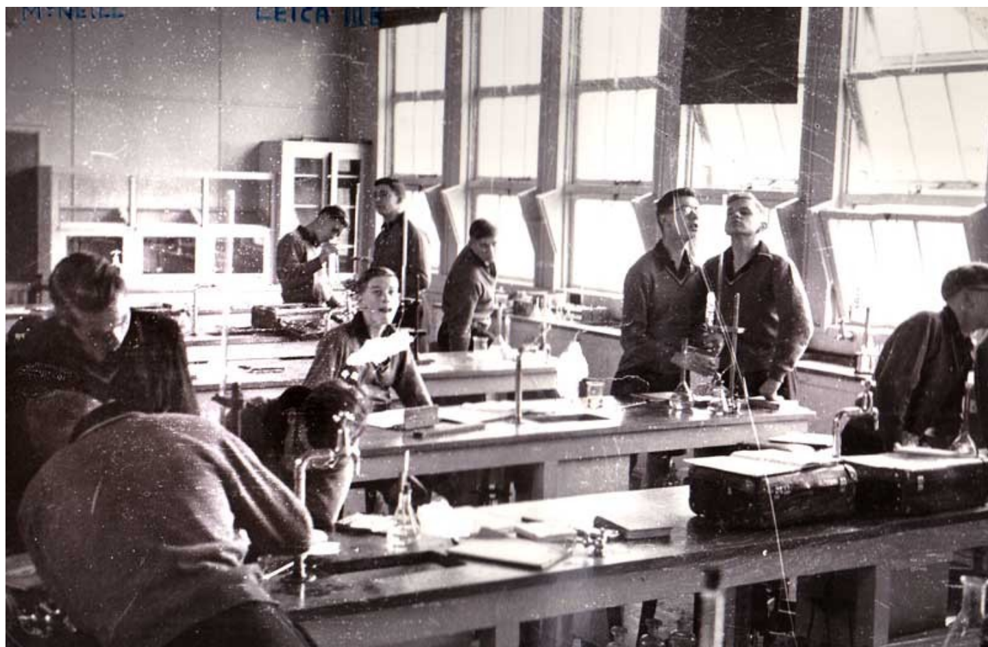
Einsteins of tomorrow in the Chemistry Laboratory