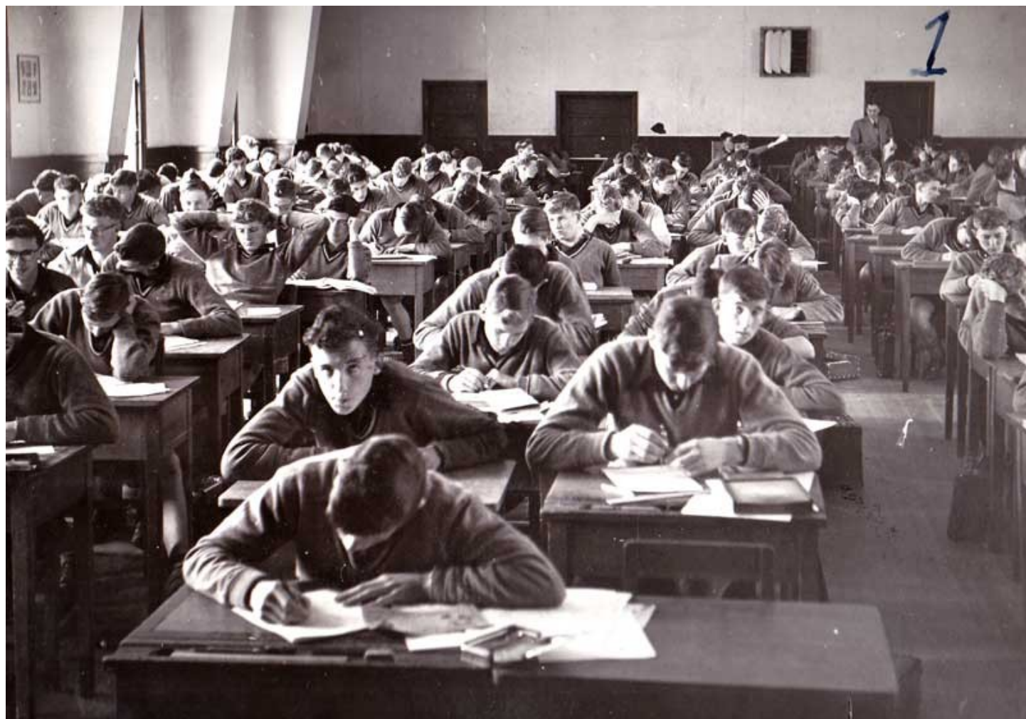
Fifth Form Examinations in the Assembly Hall