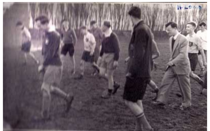
Notice teachers' downcast looks