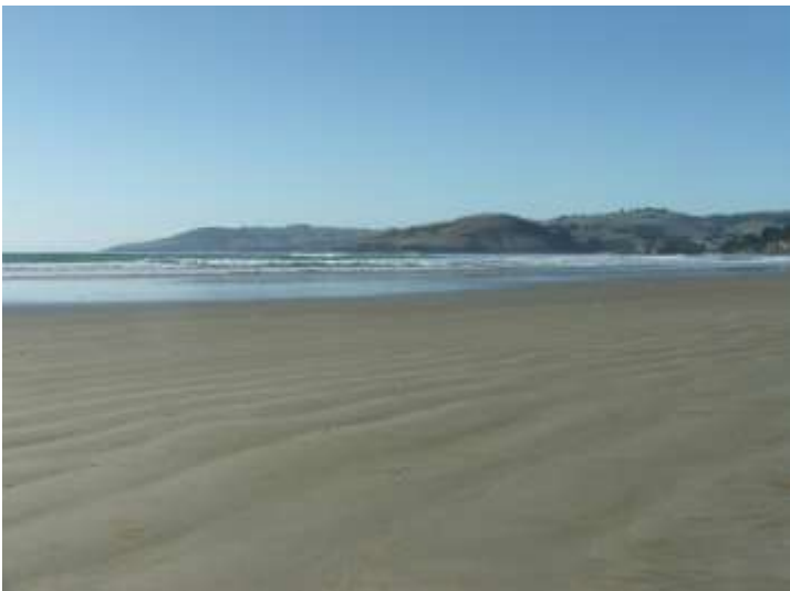
Warrington at its best.