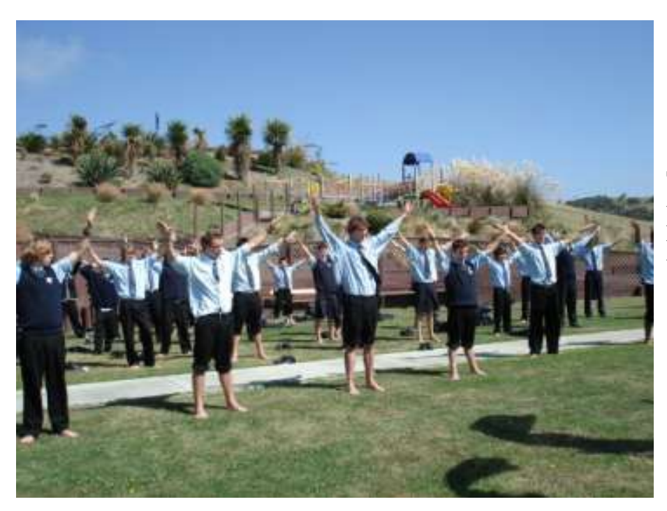
The boys take part in a prelunch spiritual exercise, very like Tai Chi.

Prefects and international students visted Karitane marae this week as part of their orientation programme. It gave our prefects a wider appreciation of the community they live in and a chance for our international students to learn something of Maori life and culture. Left boys are welcomed