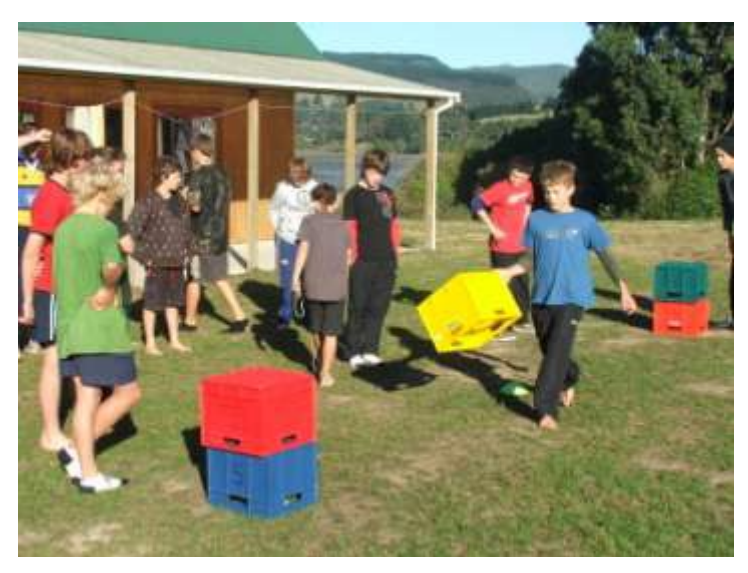
Group initiative challenge